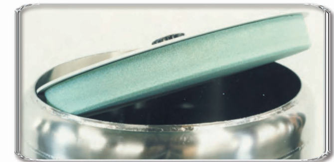
Foam Insulated Lids