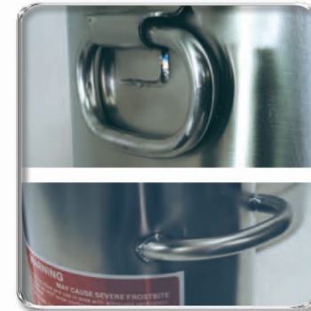
Flap-Down or Rigid Handles